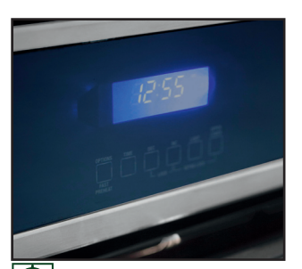
The ability to lock the oven door and the keyboard along with the four glass doors supplied with the oven are the best guarantees for safe and serene use.

Experience the precision of professional cooking with our meat probe that measure in real time, the core temperature of your food.