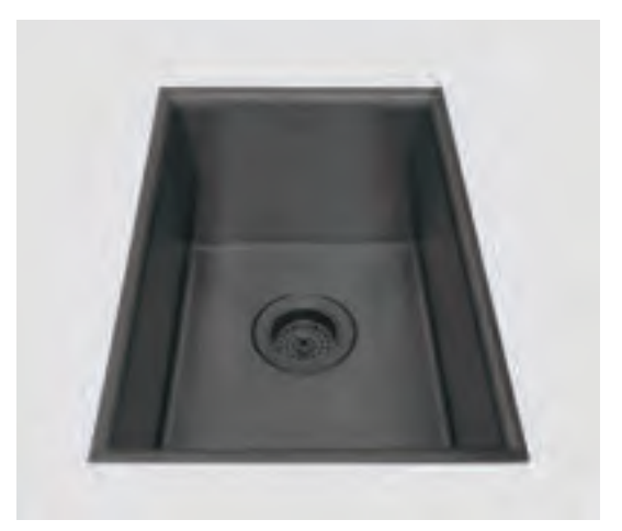
*Flush-Mount Installation Kit is included with each sink *Custom ADA compliant versions are available