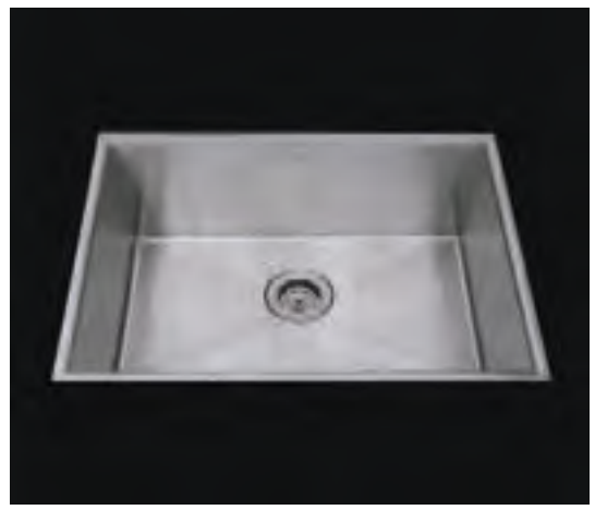
*Flush-Mount Installation Kit is included with each sink *Custom ADA compliant versions are available