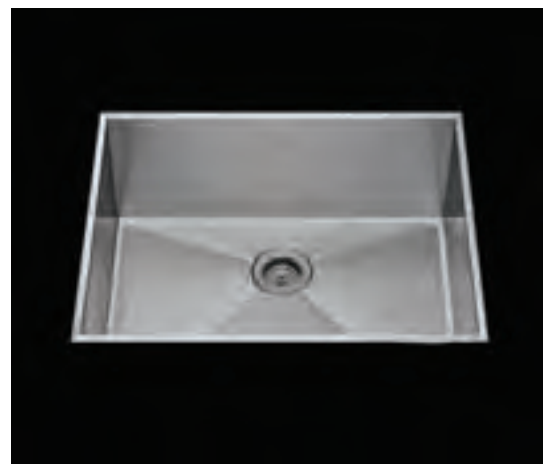
*Flush-Mount Installation Kit is included with each sink *Custom ADA compliant versions are available