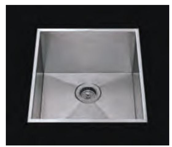
*Flush-Mount Installation Kit is included with each sink *Custom ADA compliant versions are available