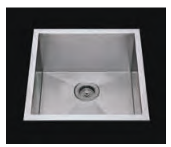
*Custom ADA compliant sinks are available

• MINIMUM CABINET SIZE (I.D.) Flush-mount 21.5"