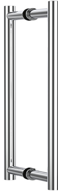
Double Door Handle shown with a small Rosette