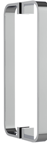
Double Door Handle