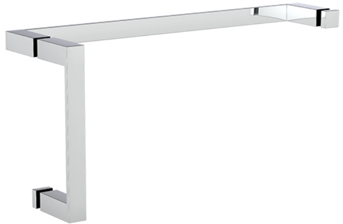
Offset Door Handle Shown with no Rosette